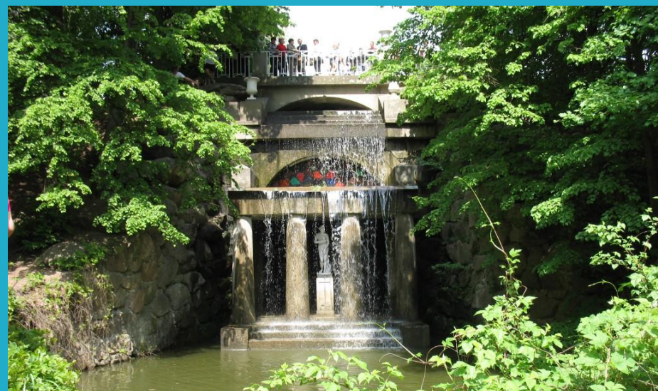
Sofiyivka park in Uman